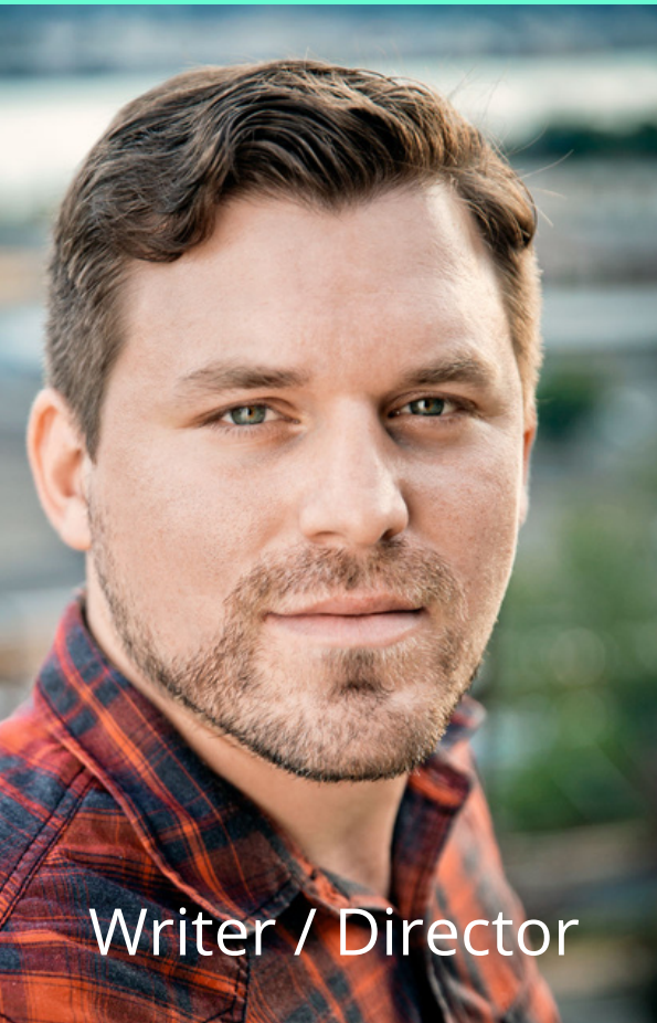
Writer / Director